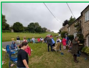
Food & drink