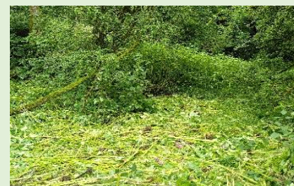
Himalayan Balsam cleared.